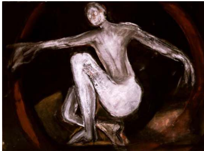
Woman Chalk Figure