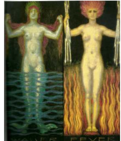
Water Fire Detail Franz Von Stuck, 1913

INTEGRATIVE DISCUSSION & CLOSING CIRCLE, Presenters & Participants.